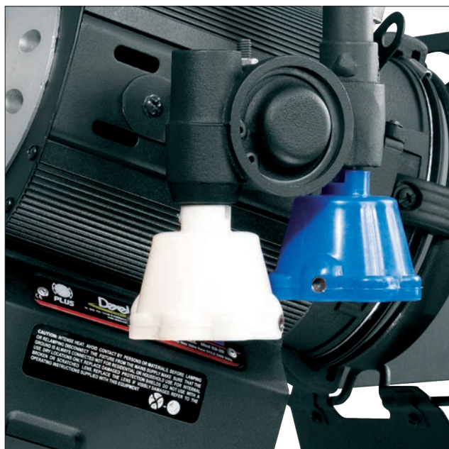
Pole Operation Version