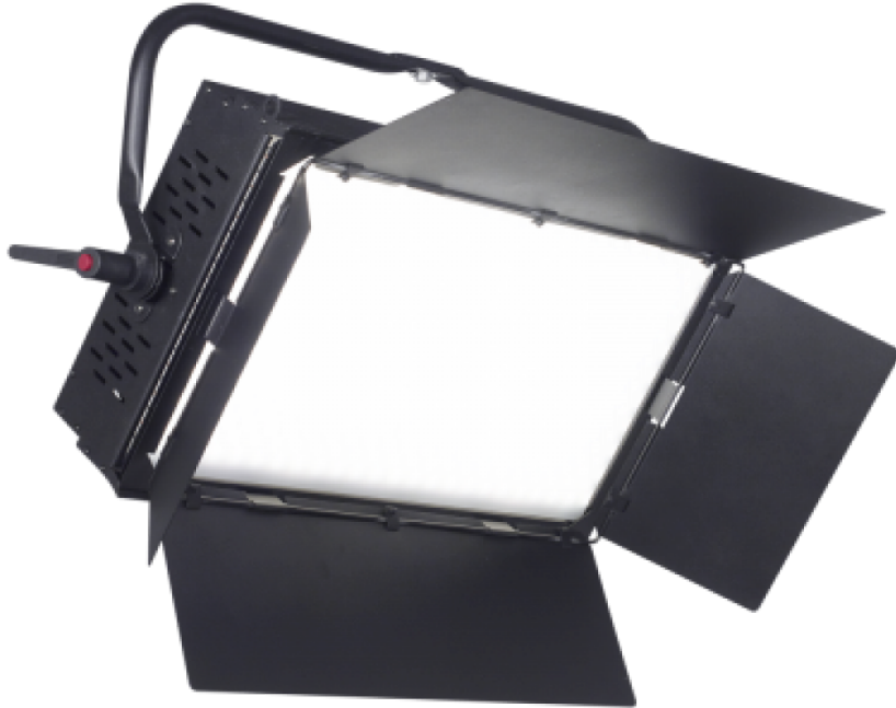
PRIXMA FLEX 200w 53-43

PRIXMA FLEX 200W are Professional Led lighting panels, offering lightweight and compact construction with style and design. Available versions with adjustable color temperature (Variable White Color) versions 3200K° to 5600K° or 2800K° to 6500K°, and Single color 3200K° or 5700K°. Perfect application for large areas of TV Studios, Film and Photo. PRIMXA FLEX 200W are new generation of lighting fixtures, developed with the latest technology for producing high performance in lighting and energy efficiency, with high CRI and TLCI rating. >95. Operates cool with efficient heatsink Provides soft and even lighting for the whole range, deleting shadows, with high lighting quality Interchangeable diffusion filters, accept barndoors 4-leaf. DMX and Manual control.. It works at 100-240V